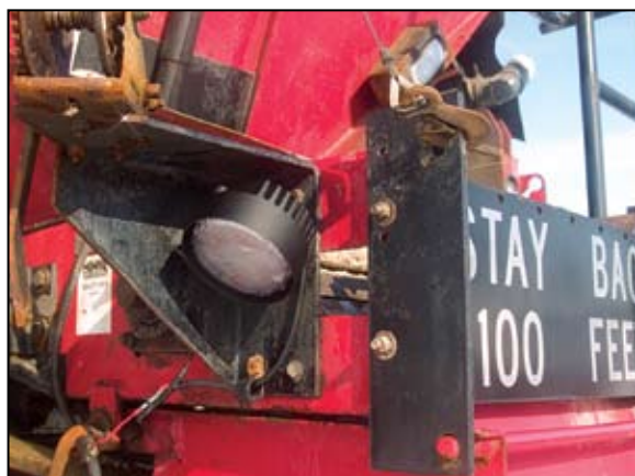
Work light mounted to the rear of a salt truck provides unparalleled illumination and reliability.