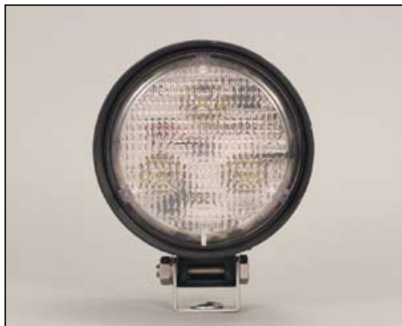
New 500 Lumen PAR 36 LED Work Light is available in Spot, Flood & Trapezoid illumination patterns.

LED Work Lights - 500 Lumen PAR 36 & 4" Round