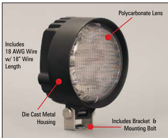
Rugged light is built for demanding work environments with adjustable & versatile mounting bracket.