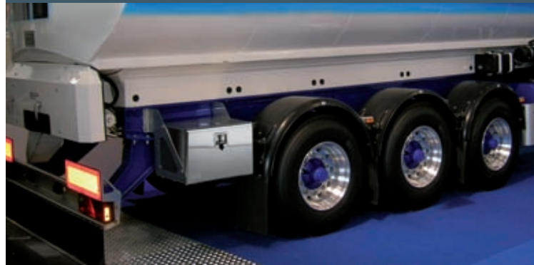
Semi trailer equipped with BAWER 37 MONO.