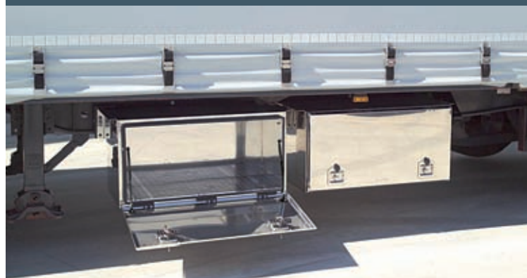
Semi trailer equipped with two BAWER 37 DUO toolboxes. One of them is open.