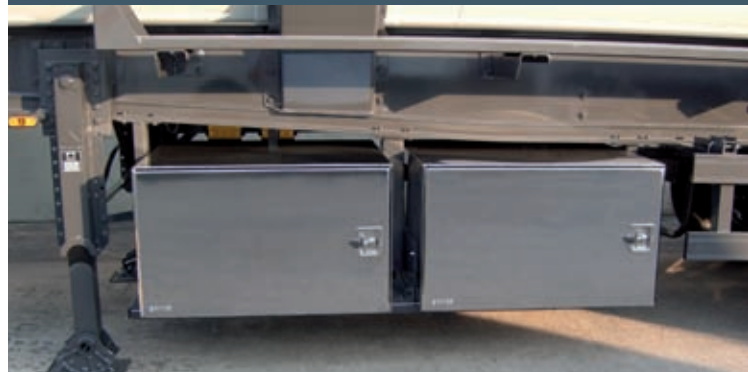
Fitting-out with two BAWER 37 MONO toolboxes with lateral opening.